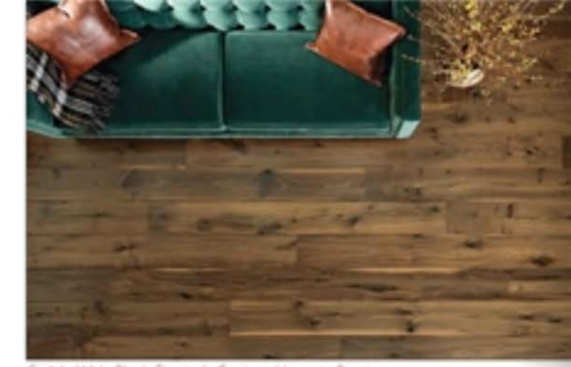
Carlsle Wide Plank Flooring's Carriage House in Remington.

The company emphasizes that all products are customizable,