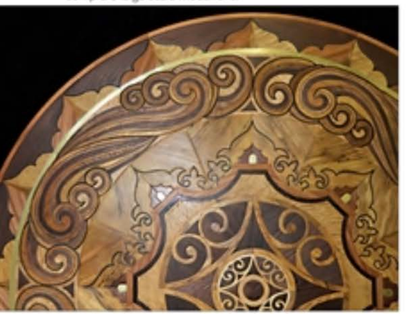
Unbroken, a karge-scale medallon from Divine Flooring.

Divine Flooring, which just last year joined the Luxel-Iome group of high-end showrooms on the ground floor of the Merchandise Mart, is best known for its higher end hardwood offering, but it also has lines of LVT and laminate flooring, across a broad range of price points. This year, the firm introduced six 12"x24" WPC tiles, focused on stone looks. Its WPC offering includes the Voyage II collection of planks in 81/2" widths and 5' lengths, including The Score, a near-black vintage painted wood design with heavy texture. This year the firm also showcased complex, large-scale medallions.