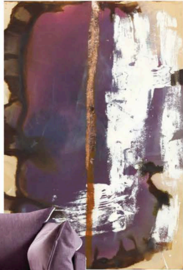
Zoe Bios Creative