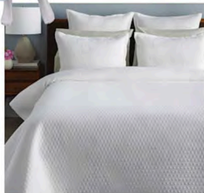
▲ Sissy Inc.'s Riley bedding set features a mini-geometric embroidery that provides minimal design with elevated style - whether layered or set alone.

Atlanta AmericasMart, 9-A-20, B1; Las Vegas World Market Center, C-591 and C-598