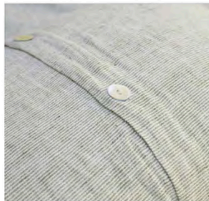
▲ Pam Pam At Home's Logan duvet is woven with a pair of colored yarns for a heathered effect and finished with subtly frayed edges of soft linen and shell button closures. Available in navy, olive and terra cotta.

Atlanta AmericasMart, 13-A-7, B1; Dallas World Trade Center, 520; Las Vegas World Market Center, C-524B