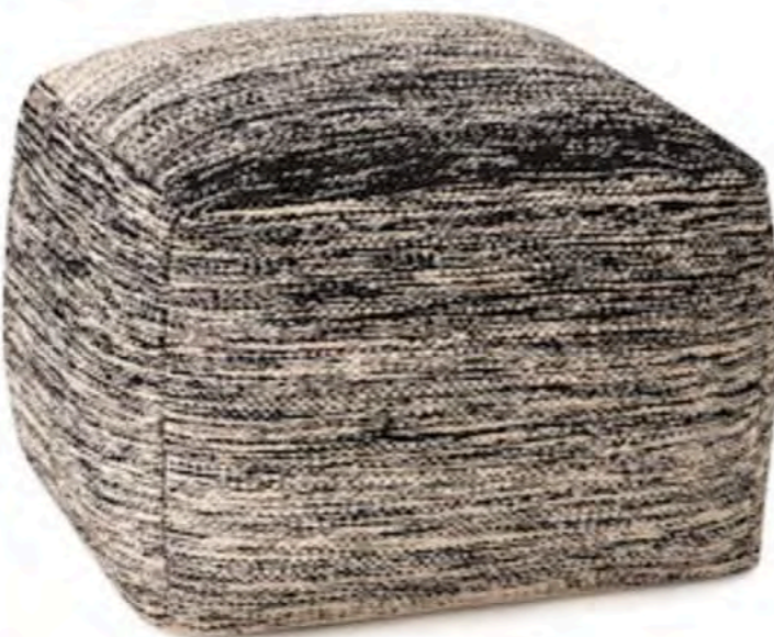
▲ Itax Worldwide Home's Coffee Talk pouf is upholstered in hand woven cotton and is densely filled with polystyrene bead filling for a firm form and comfortable support.

Atlanta AmericasMart, M9-A-21, B1; Dallas World Trade Center, G188, The Gallery; Las Vegas World Market Center, C-596E