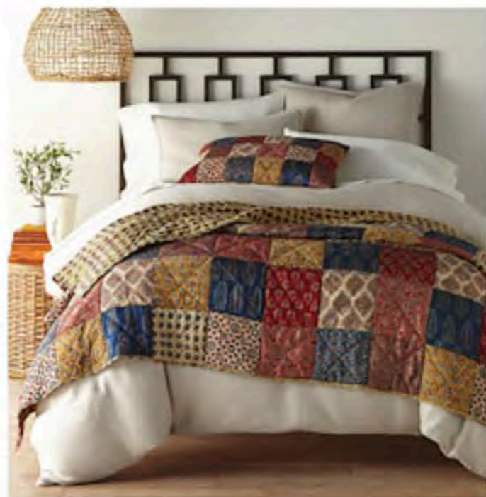
▲ Amity Home's Uma is a 100% cotton, pieced fabric quilt in vintage patterns and warm palettes of deep blue, red and yellow. It is paired here the Caleb 100% cotton duvet cover.

Atlanta AmericasMart, M9-A-21, B1; Dallas World Trade Center, G188, The Gallery; Las Vegas World Market Center, C-596E