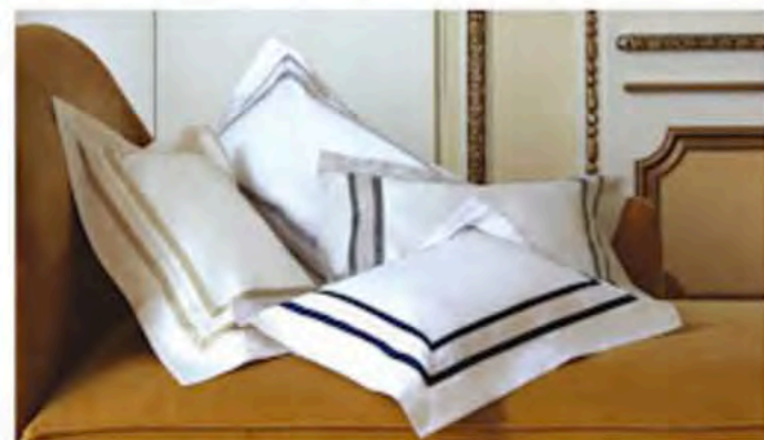
▲ Stesa by Signoria Firenze exemplifies classic Italian styling with luxuriously soft, 300-count satens. Made in Italy, the collection comes in white or pearl and is embellished with applique flanking a central hemstitch. Available in several neutral colors.

Atlanta AmericasMart, 1415, B2; Dallas World Trade Center, 219; Las Vegas World Market Center, C-707