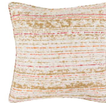
arie pillow 20", $160, surya.com