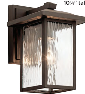
kichler capanna light 10¼" tall, $105, lampsplus.com

Fast-growing CREEPING ZINNIAS add pops of yellow to the flower beds. ▶