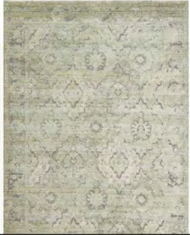
Striking and sophisticated, the Ophelia Collection for Magnolia Home by Joanna Gaines reimagines historic patterns in a color palette for today. Power-loomed of viscose and polyester, the rug balances hues of Sage and gray. Crafted by Loloï. www.loloirugs.com