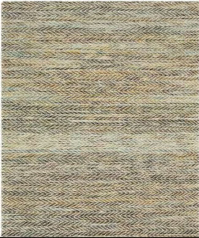
Hand-woven of 100 percent wool, the Kinley rug from Surya lays flat on the floor. Sage blends with Teal, Grass, Camel, Olive and Cream to create a collage of color. www.surya.com