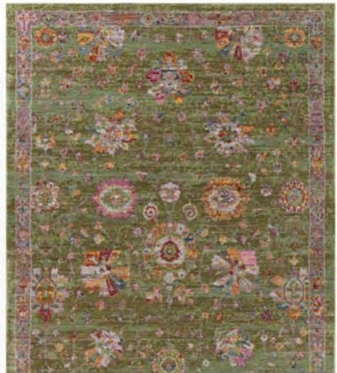
KAS Rugs' Ashton Collection reminisces on old-world beauty while incorporating a color palette for today's consumer. This machine-woven, traditional-style rug is cross-woven and space-dyed of polyester in Turkey. www.kasrugs.com