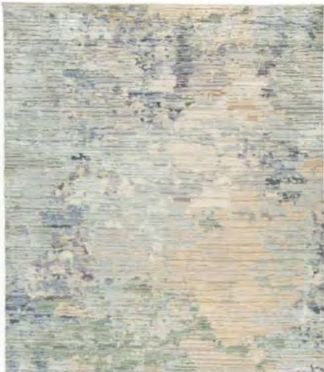
On-trend yet timeless, Feizy's Breeel Collection has a textural fashion sensibility in a luminous raw-silk shag construction. Each hand-knotted masterpiece marries a luxe sheen with soft hues for an abstract design that fits nearly any space. www.feizy.com