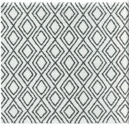
United Weavers of America's Tranquility collection is a modern grouping of geometric patterns and modish colors interpreted on a machine-woven construction of microfiber polyester and jute. Las Vegas World Market Center: A-409