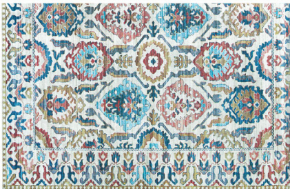
Couristan's Pasha collection is machine-woven on a polyester base. It depicts digitally printed Old World-inspired designs in updated colors. Las Vegas World Market Center: B-360