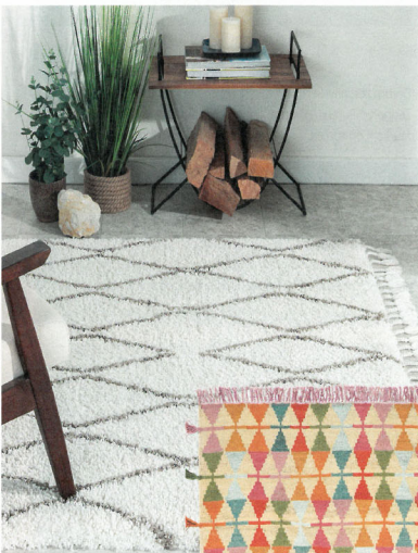
Natco Home/Central Oriental continues to expand its Trisha Yearwood program with the Refresh collection of soft, thick-pile rugs made of polypropylene. Las Vegas World Market Center: A-452

IMC will host the Atlanta International Area Rug Market from July 10-14 and Las Vegas Market July 28 to Aug 1.