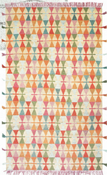
Surya Inc.'s hand-woven Adia collection pairs neutrals with dusty brights in patterns across coastal, cottage, rustic and bohemian themes. Atlanta AmericasMart: II-A-1, BI