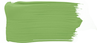
LUCKY YOU Portola

Bright colors jibe when they have the same value (amount of white or black).