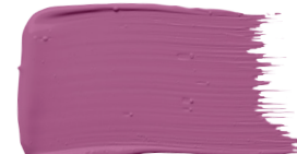
VIVID VIOLET DE5012 Dunn-Edwards