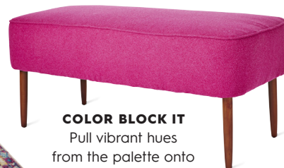
COLOR BLOCK IT Pull vibrant hues from the palette onto furniture in solid colors. Milo bench, $175; onekingslane.com