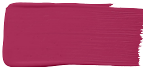
HEART'S DESIRE OL602.6 Olympic