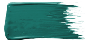
POSEIDON SW 6762 Sherwin-Williams