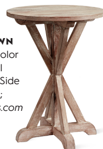
TONE IT DOWN Tame riotous color with natural wood. Sawyer Side Table, $299; potterybarnkids.com

PHOTOS: (ROOM, THIS PAGE) CHICHI UBINA, (OPPOSITE) MANOLO YLLERA