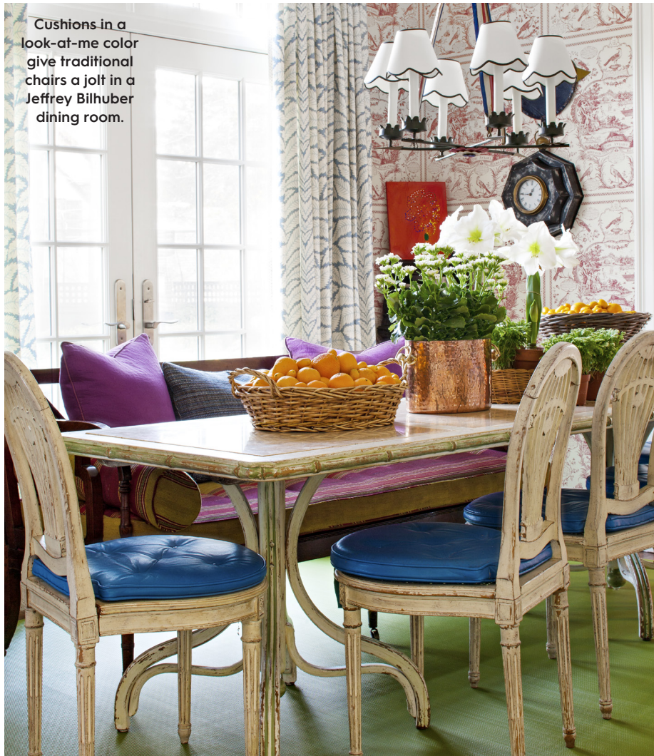
Cushions in a look-at-me color give traditional chairs a jolt in a Jeffrey Bilhuber dining room.

For an upbeat room that enlivens your senses—and neutral furniture—look to complementary colors, which contribute a natural energy when paired. Choose pure hues that haven't been shaded with black for extra zing. "They are the brightest and cheeriest and project joy," says Sue Wadden, director of color marketing at Sherwin-Williams. They may not all seem to go together, but if you repeat the colors around the room it gives them continuity and they start to harmonize.