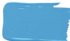
ST GILES BLUE 280 Farrow & Ball