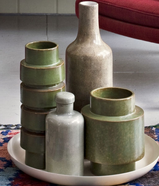
FLOOR SIMILAR TO QUIET RAIN 50BG 64/028 GLIDDEN

Stylist Martin Bourne established this palette with furniture and accessories rather than with paint.