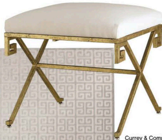
Currey & Company