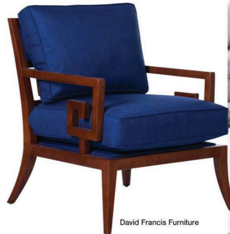
David Francis Furniture