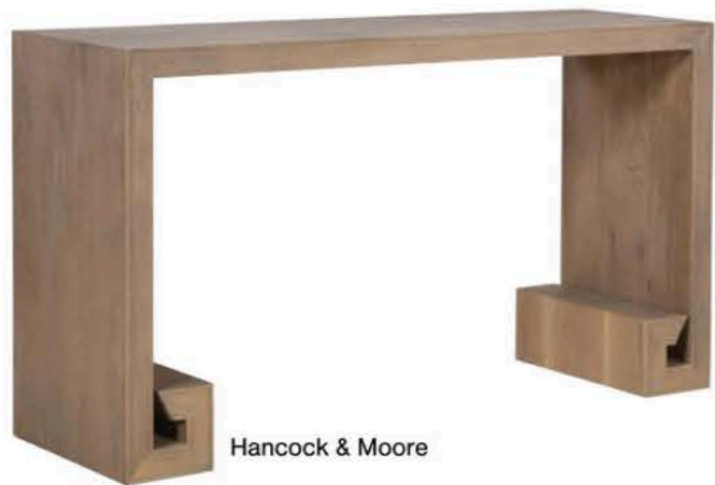
Hancock & Moore