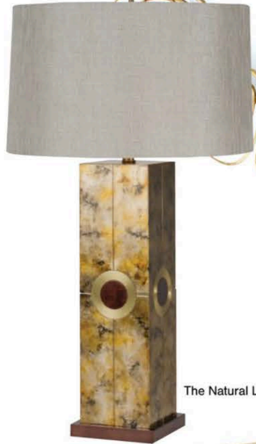
The Natural Light