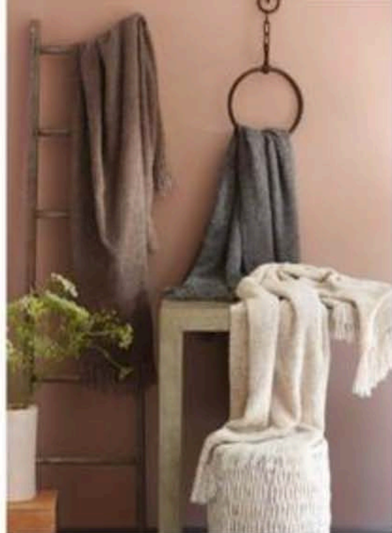
Matouk's Cooney collection of alpaca throws is hand-woven by artisans in Peru.