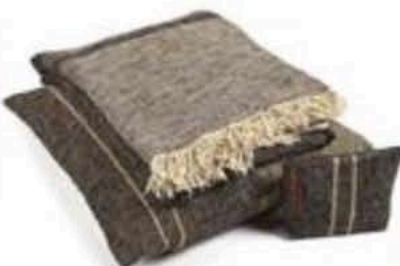
The rustic Francis collection by Belgian linen textiles house Libeco employs a black/linen plain weave construction finished with a flax fringe.