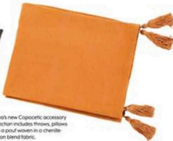
Surya's new Copacetic accessory collection includes throws, pillows and a pouf woven in a chenille-cotton blend fabric.