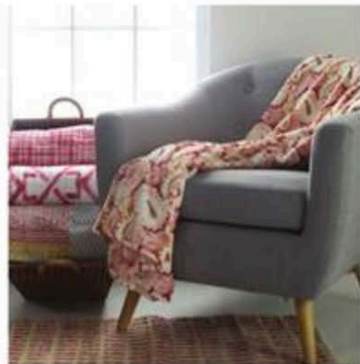
Color anchors Feizy Import & Export Co.'s new line with comfort-centric features relayed in added textures and details.