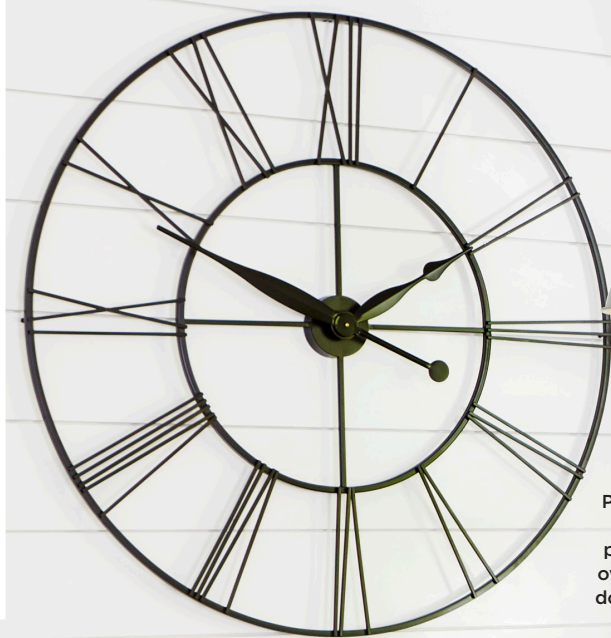
Plucked from Joanna's playbook, an oversize clock doubles as art.

A fan couple give their Sunshine State cottage a look that's unmistakably Chip and Jo.