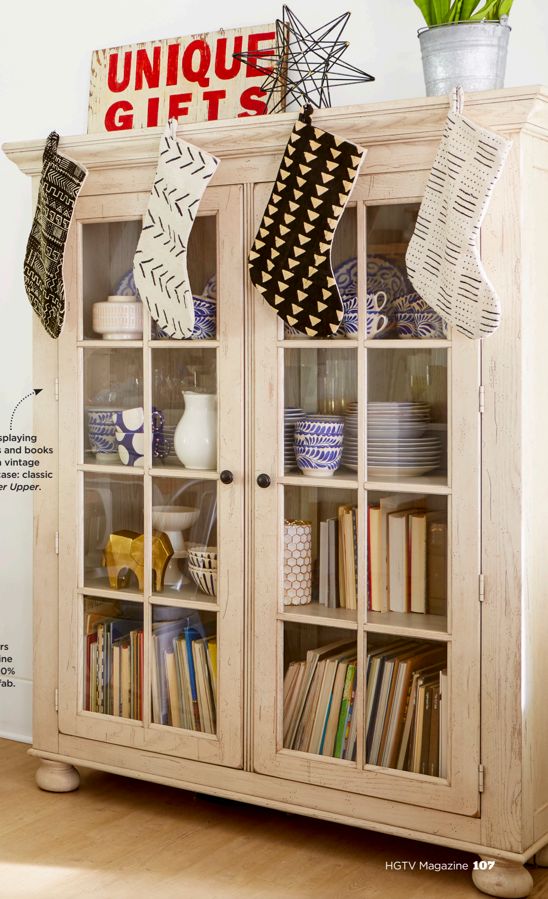
Displaying dishes and books in a vintage bookcase: classic Fixer Upper .

A fan couple give their Sunshine State cottage a look that's unmistakably Chip and Jo.